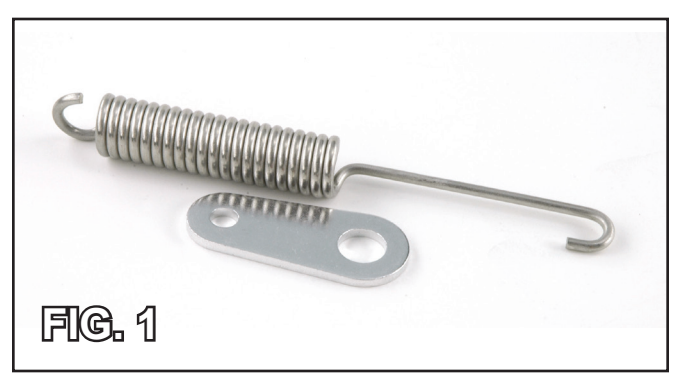
5203-PK Parts Kit