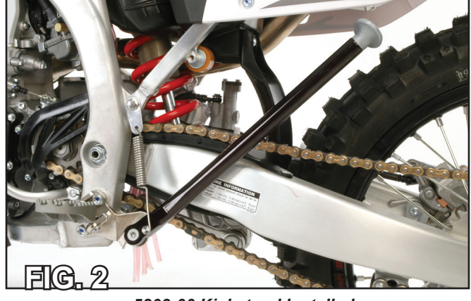
5203-00 Kickstand Installed

A. 5905-04 Kickstand Spring B. 5903-00 Hanger Tab