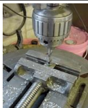
FIGURE 2-drill rear fender nuts