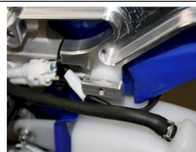
FIGURE 3-Coolant tank nut installation